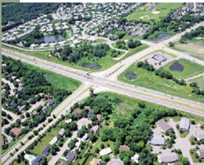
Pioneer Trail Before/After